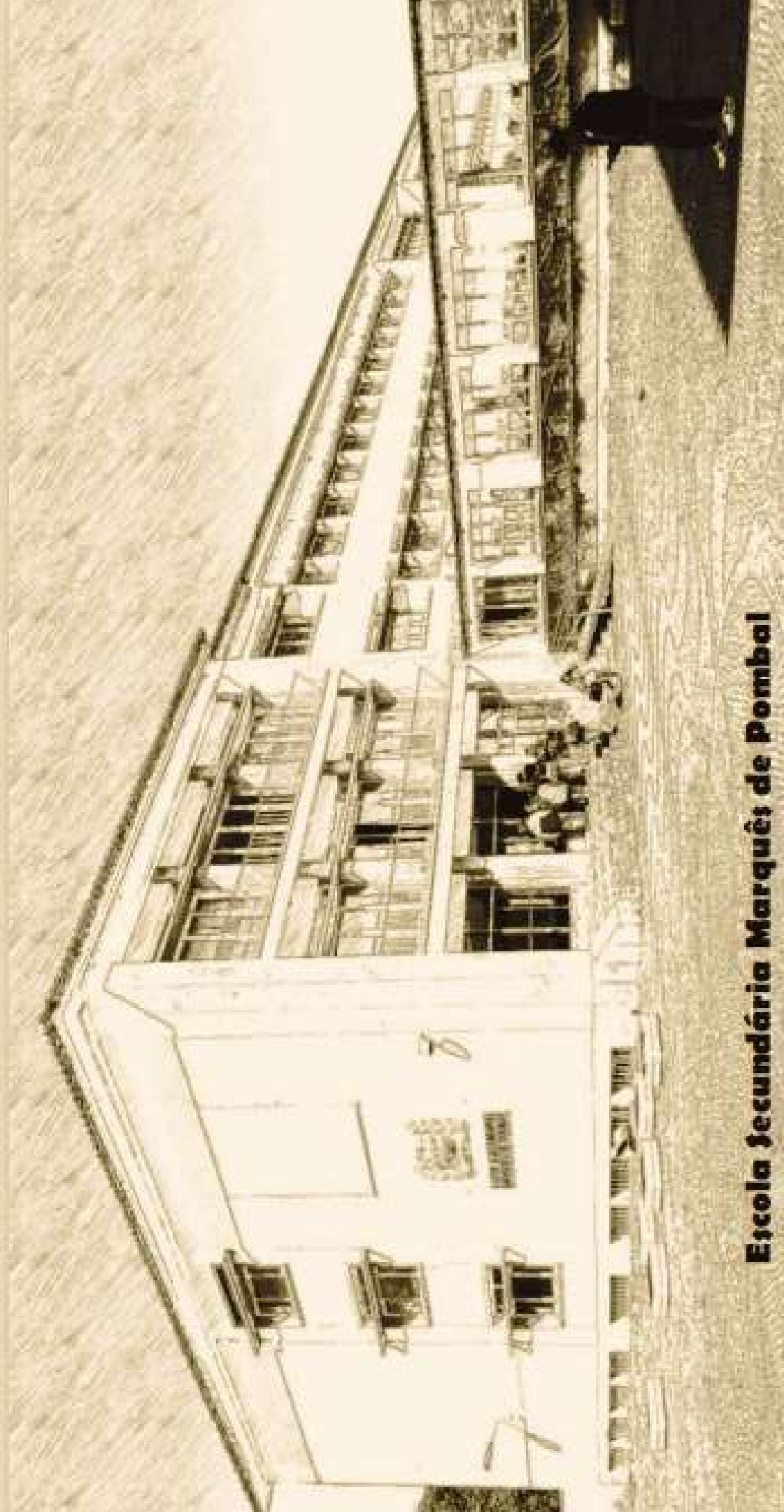
Escola Secundária Marquês de Pombal